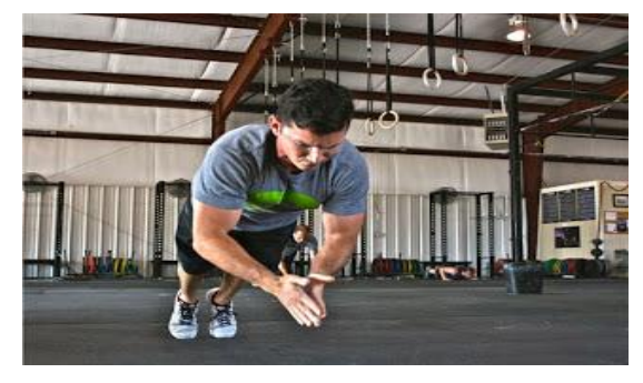
Figure 4: Clapping Push Up Training.