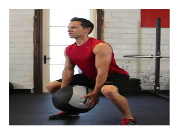
Figure 3: Medicine Ball Training.

Medicine ball training is a form of exercise consisting of a series of movements to throw a medicine ball that starts from the back of the head up and upright body, both hands holding the ball behind the head with a fast movement of the ball thrown forward.