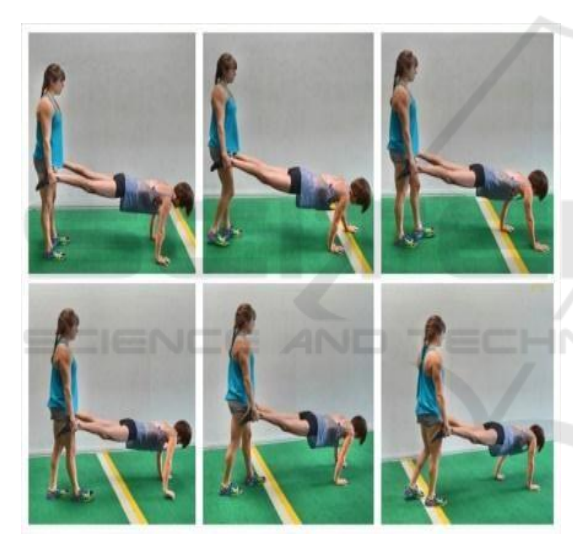
Figure 2: Partner – wheelbarrow.

This crawling partner exercise is a walking practice with two hands with the feet position held by a friend. That crawling exercises can be done also by yourself by replacing the person holding the legs of the person trying to use a simple tool (hanging the feet on a rope that has been tied). The frequency of exercise is 3 (three) times a week.