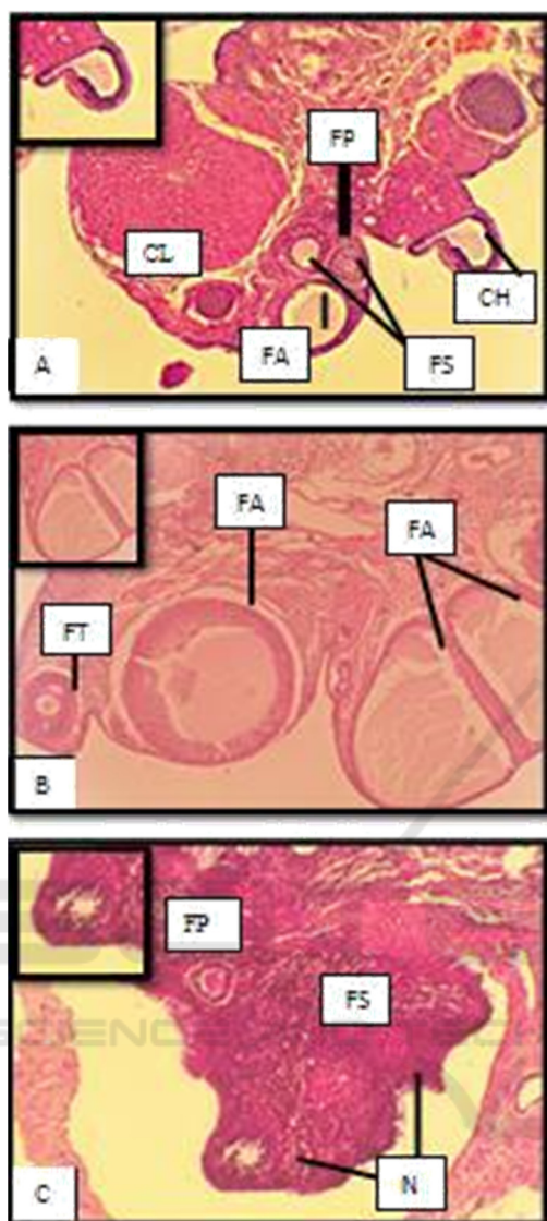
Figure 2. Histological features of folliculogenesis in the ovaries of Rats (HE, 40x); FA (Atretic follicular); FP (Primary follicles); FS (Secondary follicles); FT (Tertiary Follicles); FD (De Graaf Follicular); CH (Corpus Haemorrhagicum); N (Necrosis)