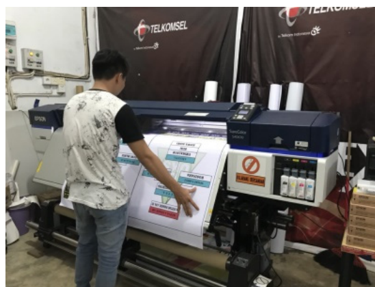
Figure 1: Measuring Levels of Benzene in the Air Working Environment