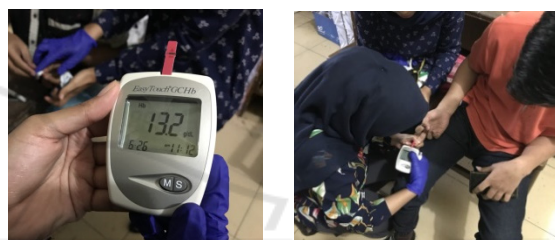
Figure 2: Measurement of hemoglobin concentration on Workers