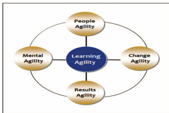
Figure 3: Conceptual Model of Learning Agility (Lombardo & Eichinger, 2000).

Changes in the business environment that is very fast to make conventional ways of working must be changed with the times. Learning agility is considered as one of the trends in human resource management that can maximize the work of employees, especially millennials.