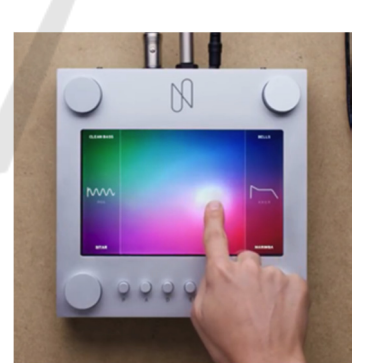
Figure 9Nsync, generating sound instrument

Second (2) Another example can be seen through the project developed by Magenta, Magenta is the development of computer learning that allows generating sound. This technology makes it possible to bring up virtual media and new materials from conventional materials, through a technology called NSync.