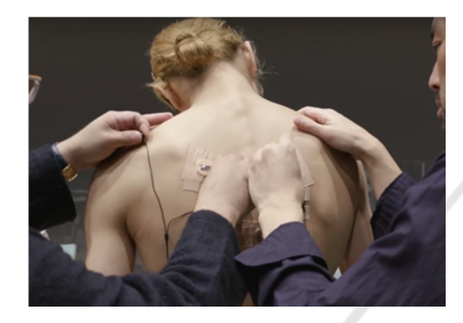
Figure 5. Body Sensor Instalation

then the movements of the back, hands and feet are converted into data, then AI directly converts them into database based melodies in the form of Musical Input Digital Interface (MIDI),