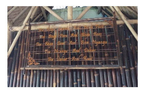
Figure 2: Guideline of Circundeu People

Another guideline adopted by the Circundeu people is "Teu Nyawah Asal Boga Pare, Teu Boga Pare Asal Boga Beas, Teu Boga Beas Asal Bisa Nyangu, Teu Nyangu Asal Dahar, Teu Dahar Asal Kuat." Meaning that "no rice fields as long as you have rice, no rice as long as you can cook rice, no rice as long as you eat, don't eat as long as it's strong"