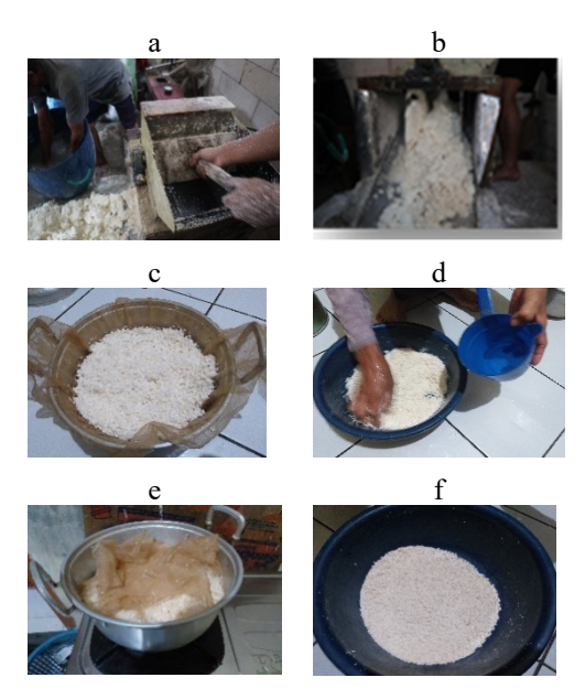
Figure 3: Process of Making Rasi

The dedication of Abu Omoh as the the founder of the Rasi, which was able to make the people of Circundeu not dependent on one food, namely rice is highly appreciated. From her ideas until now, the people of Circundeu Village feel the fruits of the idea of the struggle for independence physically and spiritually born from Abu Omoh, as one of the most influential women in Circundeu Village.For how to make it, the first thing to make Rasi is to pull out the cassava first after that it is peeled and paruded (a and b) until smooth and washed thoroughly (c) and squeezed (d) after being squeezed in the aci drying until a day after dry, lifted and crushed until powdered and soft after sifting and then made into a dough and steamed until cooked for a maximum of five minutes (e and f)