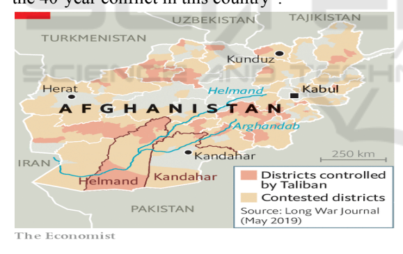
Figure 2: Map of Afghanistan (controlling area by government and Taliban (BBC Report, 2019)

"The annual report by UNAMA shows that the security situation in Afghanistan is on its worst condition. In most of the attacks (bombing, suicide attacks, explosions...etc.), only the civilians are targeted. In this case, the hot and vital situation in Afghanistan requires the support of different countries and the International Community to end up the 40-year conflict in this country".