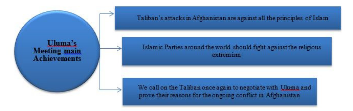
Figure 5: Uluma's meeting achievements which was held in Bogor, Indonesia on May 201(Ayaz Gul, VOA, May 2018)