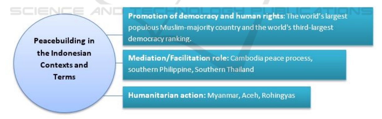
Figure 6: Indonesia's peacebuilding context (Alexandra, 2017).

Indonesia absolutely has owned the good experience of acting and being involved in mediation activities for decades, but the peacebuilding role in this country developed more than any times between 2004 to 2014 while President Yudhoyono's administration (Alexandra, 2017). The transition of an authoritarian regime to the democratic government led toward trustful stability, pointed by the ability of the government to initiate peace process that navigated the settlement of different civil conflicts, and in another case the implementation of the first direct presidential election in the country.