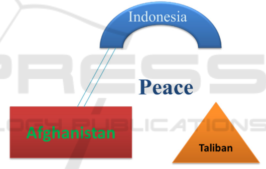
Figure 3: The position of Indonesia in Afghanistan peace (no connection with Taliban)

presence which started its duty in 2014. Indonesia also opened a new chapter of cooperation on a sustainable Afghanistan in the recent four years.