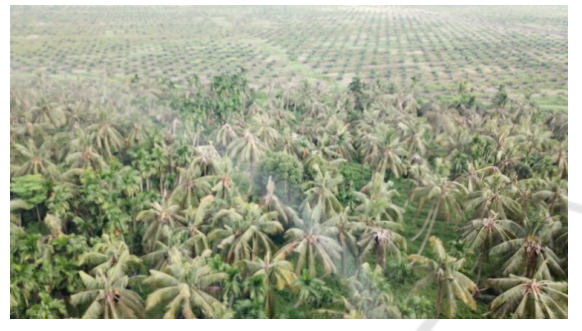
Figure 3: The condition of coconut plantation adjacent to the company palm plantation.