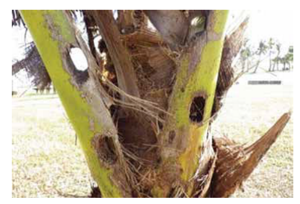
Figure 2: Symptoms of Oryctes rhinoceros infestation.