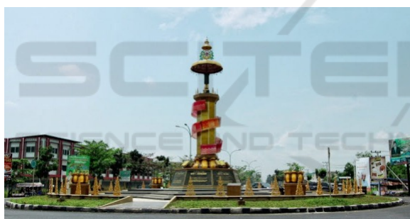
Figure 1: Songket Monument.

In this research, only two monuments that will be focus on: the Songket Monument and Keris Monument (as seen on figure 1 and 2 below this paragraf). The determination of these two monuments is because those monuments look related each other seen from the perspective of the use of male malay traditional dress that often be equipped with a keris.