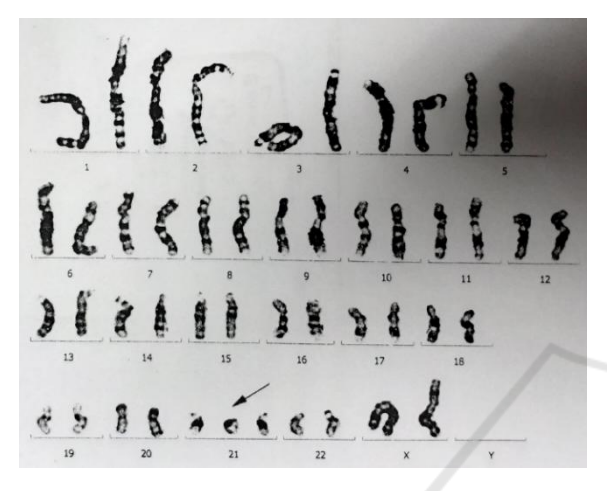
Figure 3: Chromosomal analysis.

Using a sample of blood, this test analyses the child's chromosomes. If there's an extra chromosome 21 in all or some cells, the diagnosis is Down syndrome. In this case, the patient has the traits appearance and confirmed by the chromosomes evaluation (Figure 3).