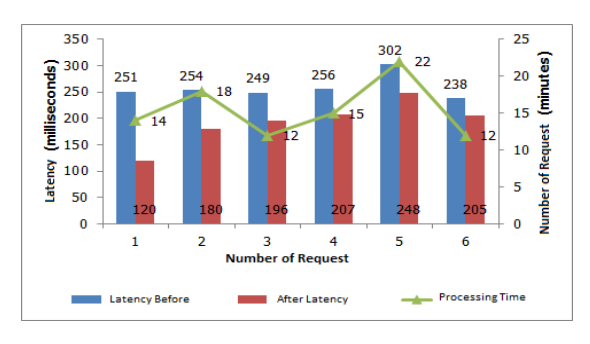
Figure 2: Bar Line Chart Latency and Processing Time

3.2 The program can do the best internet routing and routing selection from 6 Customer requests with Latency and Processing Time as shown in figure 2.