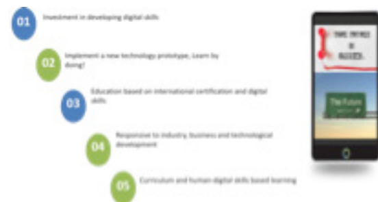
Figure 4: Respond to the future.

Martani, (2019) stated in Figure 4 that there are 5 things to respond to the future: (a) investing in developing digital skills, (b) implementing a prototype of new technology, learn by doing, (c) education based on international certification and digital skills, (d) responsive to industry, business and technological development, (e) curriculum and human-digital skills-based learning.