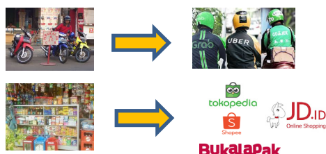
Figure 1: Conventional versus online models of 4.0 industrial revolution in Indonesia.

Financial Technology is increasingly needed in industry 4.0 towards the era of society 5.0. This need was triggered by the many brokers that made marketing a product very expensive. The existence of Financial Technology can eliminate brokers, cut the product marketing chain. The effect is that consumers can get products at affordable prices and good quality because of direct selling (Wu, 2017). The Industrial Revolution was marked by the emergence of the big data system, cloud computing, supercomputers, smart robots, unmanned vehicles, genetic engineering, and neurotechnology development that enabled humans to optimize brain function further. In this 4.0 industrial revolution manufacturing activities were integrated through massive wireless and big data technology. Figure 1 shows the conventional versus online models of 4.0 industrial revolution in Indonesia.