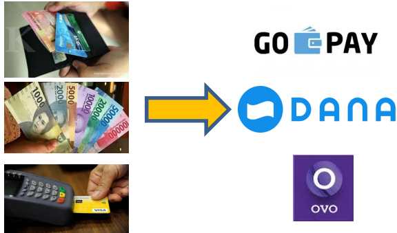
Figure 3: A few of conventional versus online models Fintech in Indonesia.

Application Programming Interface (API) between companies and Fintech banks and promotes payments without cash. Figure 3 shows a few of conventional versus online models Fintech in Indonesia.