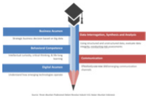
Figure 5: Mastery 5 elements of ICT.

Figure 5 shows there are five mastery elements that help the process of identifying and gathering accounting information in the Industrial Revolution era 4.0: (i) Business Acumen, (ii) Behavioral Competence, (iii) Digital Acumen, (iv) Data Interrogation, Synthesis, and Analysis, (v) Communication.