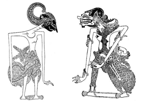
Figure 1. The Arjuna figure (left) which is classified as an alus/luruh and Cakil character (right) is classified as a "gusen" character.

The figure of bambangan in the "Perang Kembang" in this study is Arjuna who has the character "alusan" or "luruh" who opposes Cakil who is classified as a "gusen" character whose behavior is very attractive. The contrast between the two characters eventually became an attraction in the "Perang Kembang" scene which was adopted into the Bambangan-Cakil dance.