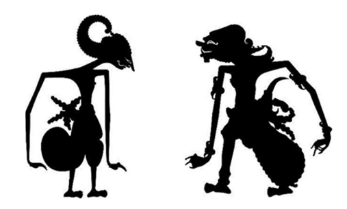
Figure 2. Arjuna and Cakil puppet modeling

The following are pictures that explain the experimental process of transforming the shadow motion of the "Perang Kembang" scene into silhouette animation.