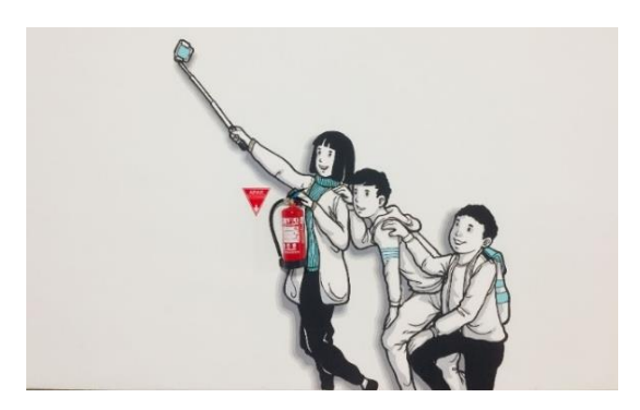
Figure 2. Fire Extinguisher visualization that is punned into a selfi-able and Instagram-able object

For those who live far away from relatives and / or family, the airport can be a place that can awake the feelings of sadness. Because this is where they separated from their loved ones. The visual puns of Fire Extinguishers at Soekarno-Hatta Terminal 3 is able to present a cheerful, pleasant and entertaining atmosphere. The visual puns of the Fire Extinguisher was originally intended for children but ultimately attracted the attention of the adult community as well. The slick impression is displayed through mural artwork with the theme of the meaning of the Fire Extinguishers themselves. The general impression that often appears in the display of Fire Extinguishers in general is that they are serious, rigid and tend to be tedious.