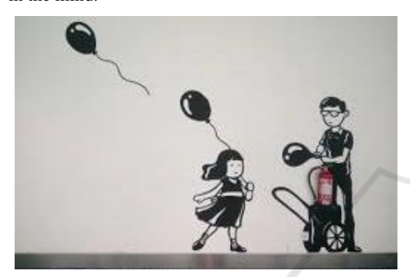
Figure 5. The Fire Extinguisher visualization was set into a balloon helium gas cylinder

The use of visual puns on the Fire Extinguishers display at Soekarno-Hatta Terminal 3 proved effective. Which in the beginning was intended to attract the interest of young children, in fact, adults also like. The uniqueness and novelty of ideas is one of the aspect that makes this work of art can be categorized as a successful work of art. Artwork which was then used as a communication medium that had the effect of building memory that was fixed in the mind.