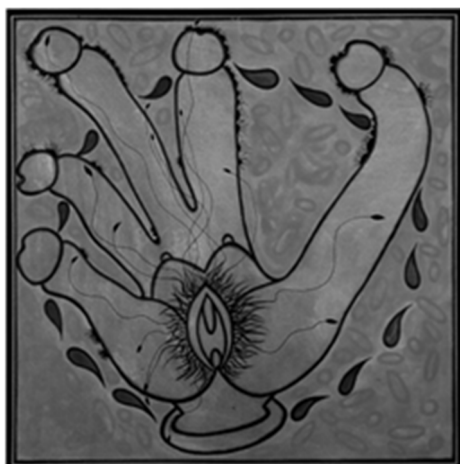
Figure 5 : IGAK Murniasih, Waiting , 2003, acrylic paint on canvas, 100 x 100 cm (Source: Catalog of Exhibitions Via Dolorosa, Nadi Gallery, 9 April - 13 May 2003; Supriyanto, E. & Bollansee, M., Indonesian Contemporary Art Now , SNP International, Singapore, 2007).

Simone de Beauvoir revealed that women who are aware of their freedom, they will be able to freely determine the course of their lives. (Pramasmoro, 2006) Women must be aware of and do not continue to be confined to the culture of patriarchy and mass trauma. Women must be free to express themselves and be free to be human.