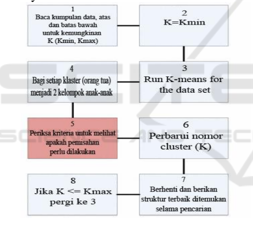
Figure 1 Steps General In X-Means Grouping.

X-means clustering is used for completely wrong the other weakness main from K-means clustering, that is the need knowledge previous about a number of clusters (K). In method this, value in fact from K estimated in something that isn't watched over way and only based on that data set alone.