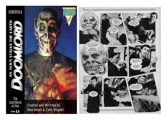
Figure 2: Fumetti entitled 'Doomlord" (1980s), http:// www.cisforcomics.gr/doomlord/ (accessed on 5th May 2019).

'Maus' is special in a way it gives a touch of a different visual, comic hand-drawings and a portrait. The presence of the portrait seems to emphasize the importance of the memory of a mother and a best friend of the graphic novel artist. He seems to want telling his readers how those two important persons mean a lot to him. The juxtaposition of black and white hand-drawing and the black and white portrait seem to indicate the sorrow happening in the story. The irony and metaphor are presented in the characters, the mice. The story narrated through word balloons and narration show the representation of the political and social situation happening at that moment.