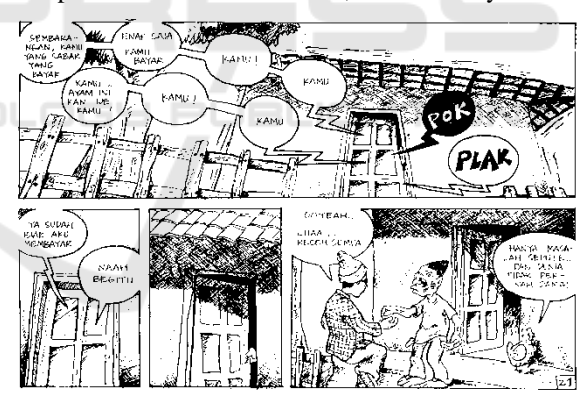
Figure 3: Interdependence of verbal text and picture, supporting a scene. Losing one of it, the meaning of the story might not be understood.

The above fumetti or photonovel was actually considered to be one of the first photonovels back then. The collaboration of photographs with the iconic word balloons as in comic would not be directly understood as a pure comic form even though all elements of comic present in that photonovel. The images look so realistic, however to make them less realistic, the panels are all in black and white, leaving the cover alone stays in full color. The convention format of a comic somehow will lead the readers to comprehend it as a comic book, in a new way.