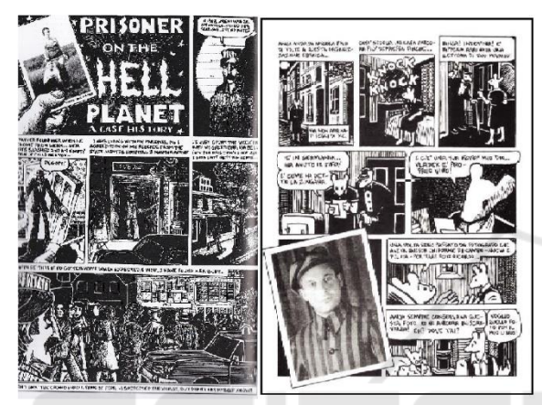
Figure 1: "Maus" by Art Spiegelman http://www. goodreads.com/book/show/15195.The_Complete_Maus (accessed on 20th May 2019).

Below is the sample of a graphic novel entitled 'Maus' that received a Pulitzer Prize in 1992. That time was the benchmark of embracing comic book, also known as graphic novel, as a part of literary world.