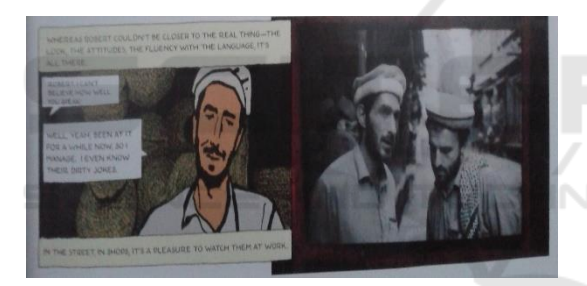
Figure 5: One of the main characters in "The Photographer" (left:comic version and right: photograph version).

The above images, picture 6 and picture 7 show how the graphic novel drawings are elaborated with photographs. Picture 7 almost seems redundant by showing the same image of a man. Yet, those two visuals with their own characteristic and mode, show their own strength in making meaning. They complement each other in visuality. The left panel with typical comic drawing emphasizes its presence as a comic, while the right panel with typical black and white photograph (even without a single word balloon) define its ubiquity as a photograph carrying a message that what is drawn on the left panel is inspired by the real life, a real man. Without appreciating all visuals, lacking information about the reality of the story might happen to the readers.