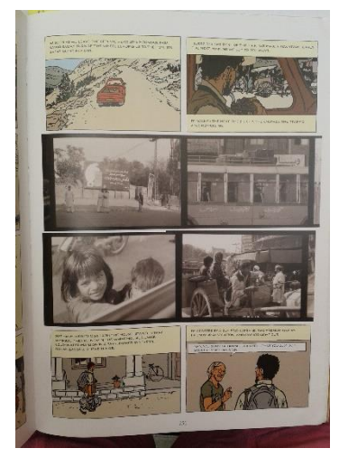
Figure 4: Situation in Afghanistan in "The Photographer".

house. The simplicity shown in that panel actually does not offer the same simplicity, as the readers need to discern the sequence of the word balloons. Failing to follow the sequence will make that panel losing its meaning.