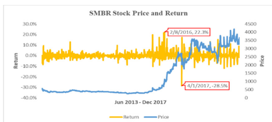
Figure 3: SMBR Stock Price and rate return (Jun 2013-Dec 2018).

Zemba & Hendrawan (2017), stated that every investor has different terms in stock valuation which cause the stock price fluctuation. The difference refers to some conditions namely optimistic, moderate and pessimistic. An optimistic condition is