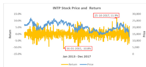
Figure 1: INTP Stock Price and rate return (Jan 2013-Dec 2018).

daily return rate, with the lowest occurring on January 16, 2015, amounting to -10.8% and the highest occurring on October 25, 2017, at 11.9%. The historical fluctuation value is an interesting thing to see if the pattern can be used as a reference for forecasting or making new assumptions and normalizing existing patterns and then determining the fair value of the company.