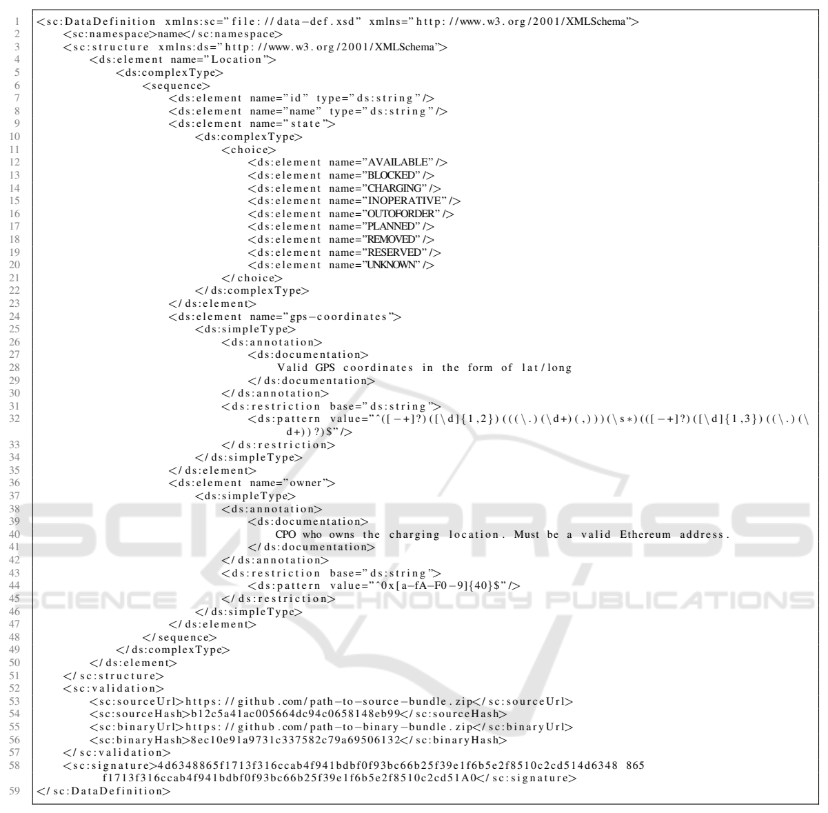
Data definition example (xml file format)