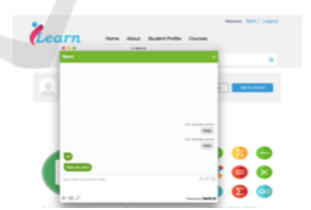
Figure 1: A Screenshot of the Website Showing the Chat.

At the start, learners were required to set up a username and a password. Subsequently, learners were asked to supply demographic information, including their age and gender. Learners were then asked to fill in a BFI personality test. Finally, learners were asked to fill in a pre-test related to the course itself.