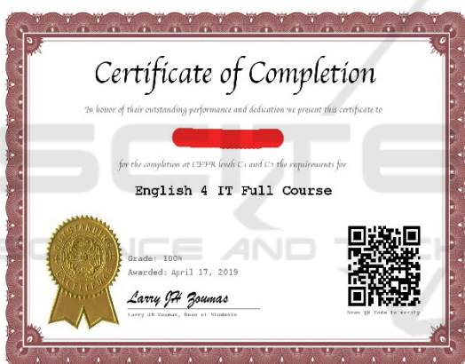
Figure 2: English4IT Certificate