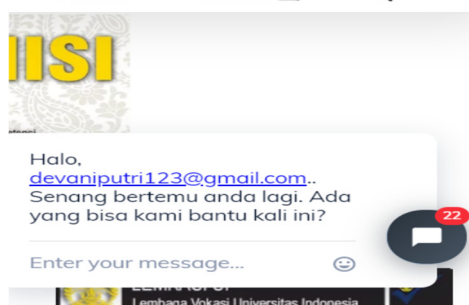
Picture 4.2 Greetings from chatbot

The chatbot can gather and answer the web visitor question automatically. Today, the chatbot can answer 5 question keyword such as study program at the vocational program, Graduate student academic title, tuition fee. Then, when visitor come back to visit the website at the other time, the chatbot will recognize and greet the visitor with mention his/her name (Picture 4.2).