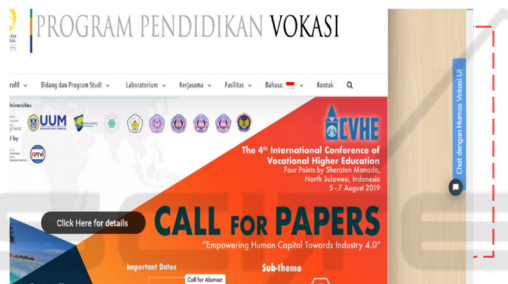
Picture 4.1 Chatbot on Website

Chatbot application has been implemented by one of the faculties at U.I., Vocational Education Program on its website (Picture 4.1). The Vocational Education Program Public Relations provide chatbot on their website to make two ways of communication with their public.