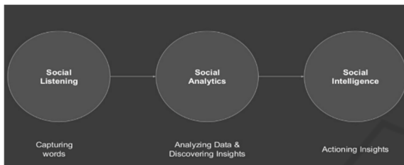
Picture 4.5 Social Media Monitoring Step