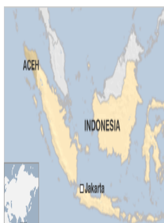
Figure 1: Location of Aceh (www.acehprov.go.id).

The development of the Aceh region which was carried out based on the understanding of the Helsinki MOU that had been paralleled by the memorandum was Law Number 11 of 2006 concerning the Government of Aceh in the Unitary State of the Republic of Indonesia. The location of the Aceh region can be stated in the following map: