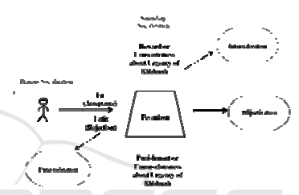
Figure 2: Confluence of Primary Socialization and Secondary Socialization in the Implementation Process of Khidmah.

This implementation process of khidmah in the pesantren does not always result acceptance internalization experienced by santri just joined as member of pesantren community. There are three results of the implementation process of khidmah resulted by a confluence between primary socialization owned by people just joined as member community pesantren and secondary socialization, i.e. pesantren. They are: committing khidmah based on reward, committing khidmah based on punishment, and committing khidmah based on consciousness about urgency of khidmah owned by the actor.