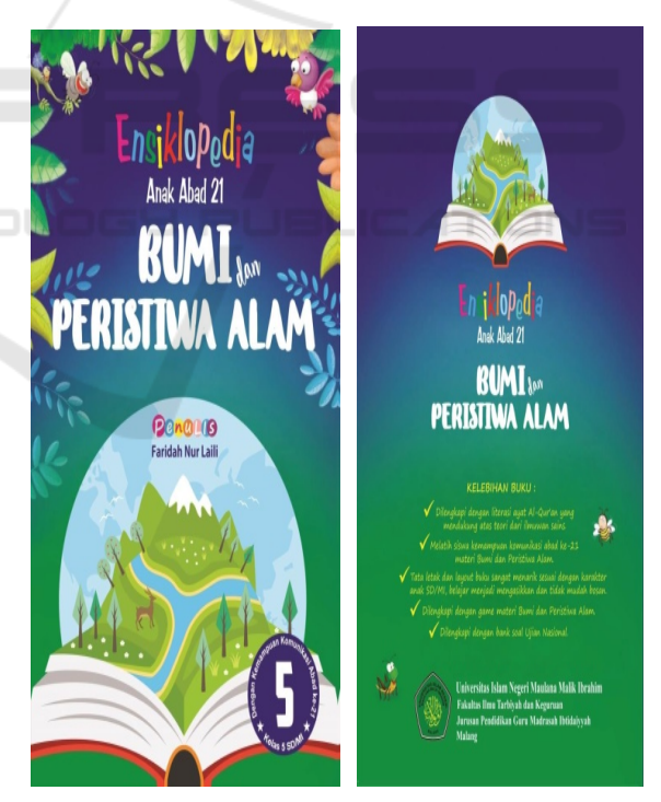
Figure 1: The cover of the developed teaching materials

The five indicators are integrated in each chapter. In detail, this encyclopedia-based teaching material has been completed with an encyclopedia usage guide, book content, competency standards and basic competencies. The material content covers the scope of the earth and the universe in the subject matter of the earth and natural events, Qur'anic literacy, and concept maps interesting facts. It is also completed with 21st century communication skills competency tests, reflections, national exam questions, and glossaries. Figure 1 and 2 are the cover and the specification of the contents of the developed teaching materials.