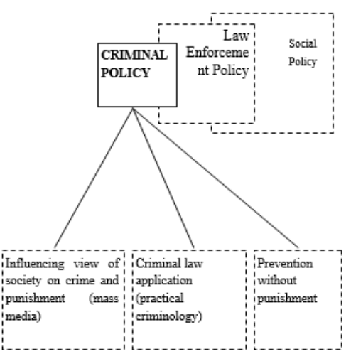
Figure 2: Criminal Policy as Part of Law Enforcement

Criminal policy or crime prevention policies according to the above two scheme it is very decisive and is determined by the law enforcement policy. So that any law enforcement against corporate crime will not be effective if they are not progressive crime prevention policies. A fundamental question in this case is that 'how is it possible to prosecute corporate crime and corporate crime of t the perpetrator is not recognized as subjects of criminal law by the criminal law itself?