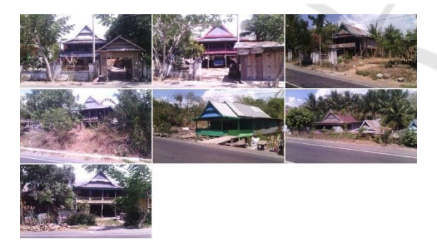
Figure 3. Objects of houses on the south side of the road

The object of this research is devoted to the traditional Bugis house with the roof of the first strata timpalaja which is marked by the form of a line on the roof facade.