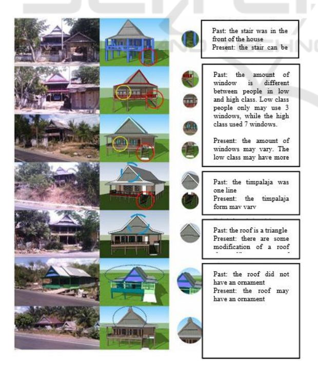
Figure 7. Analysis of the morphology of a row of houses of the road.