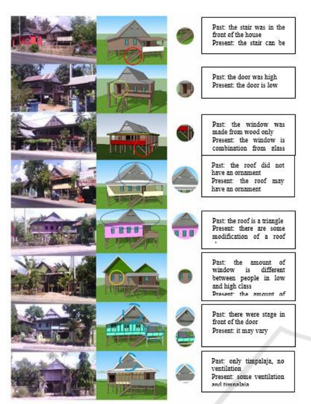
Figure 6. Analysis of the morphology of a row of Houses north of the road