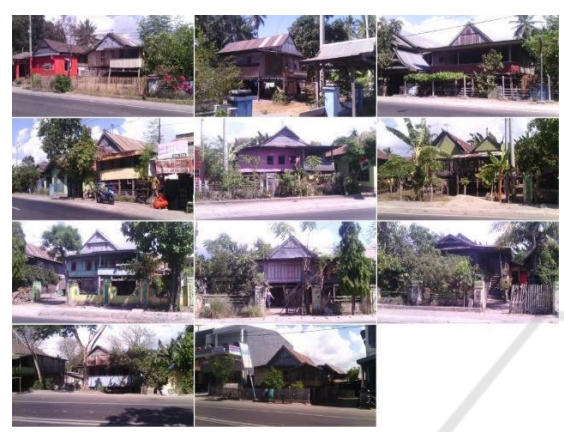
Figure 2. Objects of houses in the north side of the road

The object of the Bugis traditional house that is analyzed were 18 houses with a single strata type on the Bantaeng-Bulukumba axis road. In the row on the north side of the road consists of 11 homes. while the row on the south side consists of 7 houses. Rows of houses in figures 2 and 3 correspond to the order of houses starting from the west of the road.