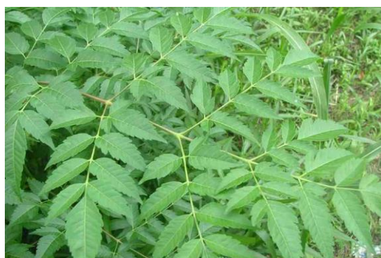
Figure 1. Mindi Leaves ( Melia azedarach L. )

In this research, the raw material were obtained from Materia Medica Batu , East Java and taken already in dried raw material.