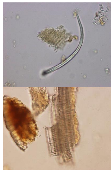
Figure 1: Various identifier fragments for mindi