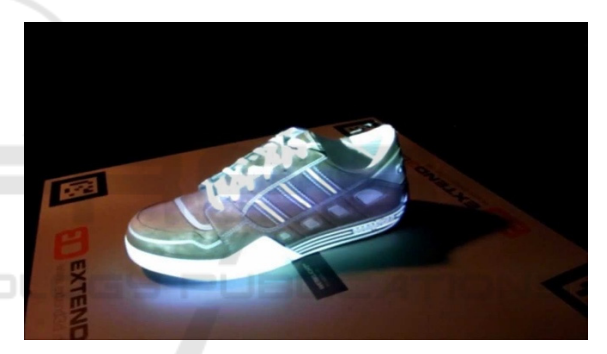
Figure 3: example of Projection-based AR

Projecting synthetic light to physical surfaces, and in some cases allows to interact with it. These are the holograms we have all seen in sci-fi movies like Star Wars. It detects user interaction with a projection by its alterations.