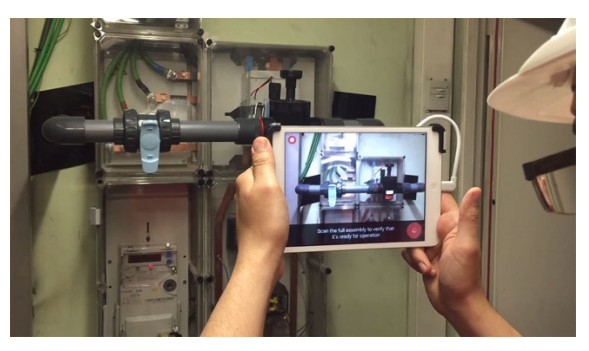
Figure 2: example of markerless AR

Location-based or position-based augmented reality, that utilizes a GPS, a compass, a gyroscope, and an accelerometer to provide data based on user's location. This data then determines what AR content you find or get in a certain area. With the availability of smartphones this type of AR typically produces maps and directions, nearby businesses info. Applications include events and information, business ads pop-ups, navigation support.