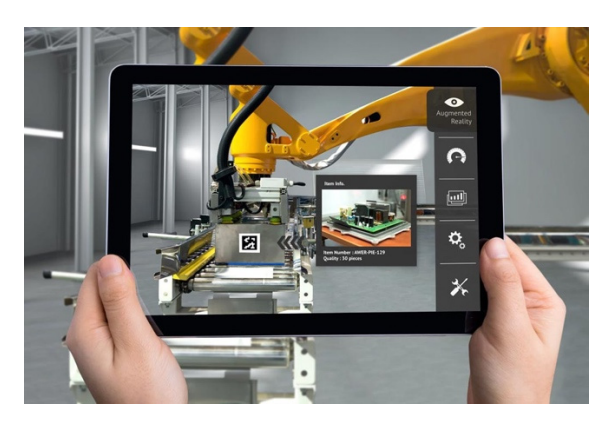
Figure 4: IKEA Catalog app as an example of Superimposition-based AR