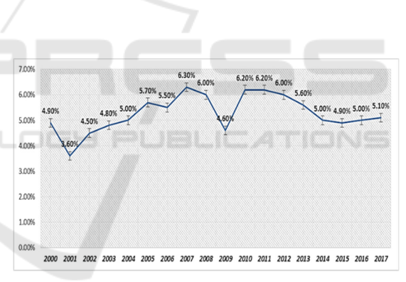
Figure 1: Economic Growth in Indonesia

Gross Domestic Product (GDP) is a benchmark for the success of a country's development. from GDP data, the value of a country's economic growth can be determined, and economic growth is defined as the rate of increase in income per capita (Sukirno, 1981).