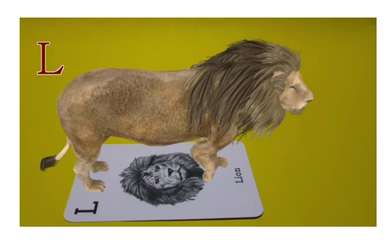
Figure 2: Example of animal appearance.

After the testing phase on the application, then in the final stage or distribution stage, researcher compiling application in *apk format so that it can be run on an Android platform smartphone device. Figure 2 shows example of animal appearance.