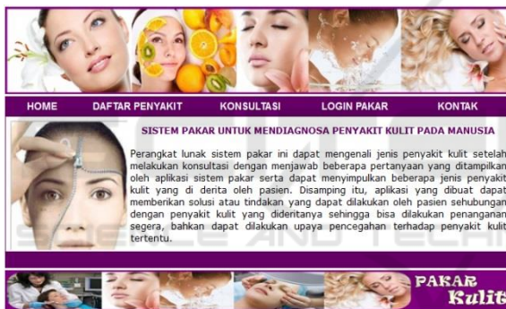
Figure 3: The main page interface (home menu)

This system performs analysis based on the dialogue between the system with the user/patient. The web-based expert system of skin disease diagnosis is designed by using PHP programming language and MySQL for database processing. Some interfaces from the skin disease diagnosis expert system are shown in Figure 3 and Figure 4.