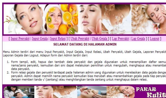
Figure 4: Interface of admin menu

The main page interface of the application (Figure 3) consist of five Menus (Home, Daftar Penyakit, Konsultasi, Login Pakar and Kontak).