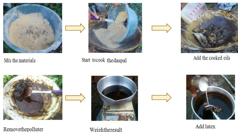
Figure 1: Process of the specimens production.

One of the mixed performance parameters in the flexible pavement is the durability of the pavement due to weather and water effects. Road conditions that are always submerged by water will decrease the durability of the pavement layer of the pavement. This becomes even worse when at the time of the process of preparing a mixture of batches, during transport, on-site deployment, and during the service period aging on the dascal mixture, thereby reducing the performance of asphalt pavement such as low stability values, intercellular cavities or less dense mixtures and bad durability. The parameters used to see the durability level of the asphalt mixture are the parameters used in comparing the stability test value with the standard stability.