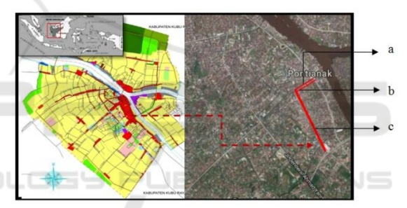
Figure 1. Observation Location a). Diponegoro Street, b) H. Agus Salim Street and c) Gajahmada Street Pontianak City, West Kalimantan

This study was conducted at trade area on Jalan Diponegoro, Jalan Agus Salim, and Jalan Gajahmada in Administrative Village of Benua Melayu Darat, West Pontianak sub-district, Pontianak, West Kalimantan (see Fig.1).