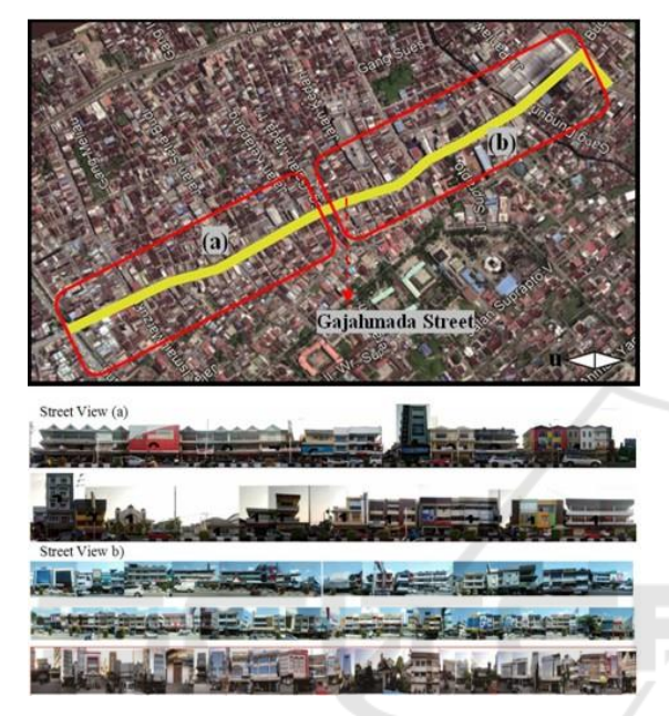
Figure 3. Serial Vision Mapping of Facade Elements on Gajahmada Street

Observations were made by making serial vision to identify and analyze facade elements on the visual quality of road corridors