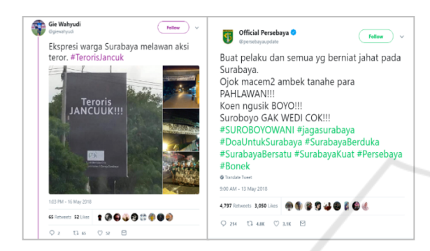
Figure 2. Response from Netizen

Figure 1 stated that "circulating photos of the bombing victims on social media is what the terrorists expect us to do to spread fear among us." Even though the tweet was officially published by the Cabinet Secretariat Official account, the picture received a massive response regarding retweets and likes from Twitter netizens (Andapita, 2018).