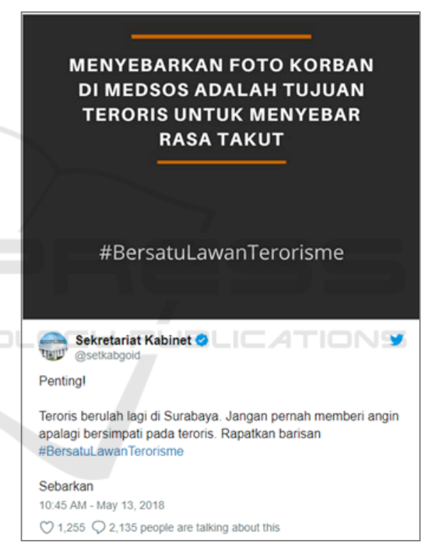
Figure 1: Tweet from Cabinet Secretariat

Thus, it provides a space for social media to take part. Zarzalejos claimed that Trump winning was influenced by the power of tweeting (Zarzalejos, 2017). For those who are sceptical of post-truth, the 'Twitter strategy' was seen of as the winning of hoaxes and lies. For those who were an optimist in post-truth, social media was perceived as the new democracy channel.