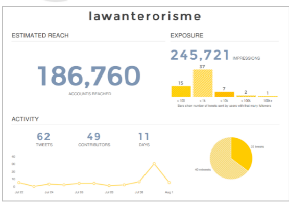
Figure 3: Related hashtags engagement on Twitter