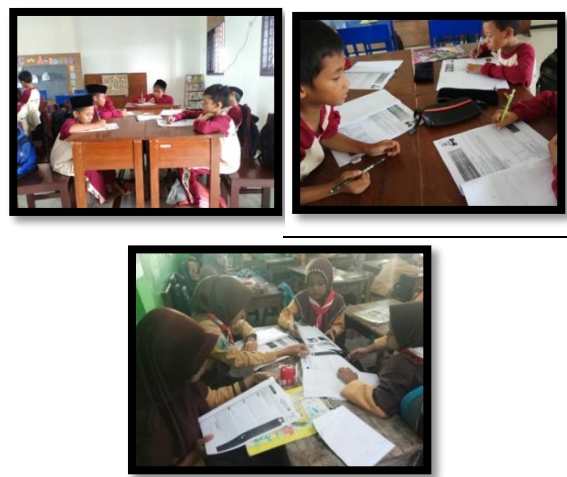
Figure 5: Cooperation in the group.

group is visible while completing a given game or worksheet. They are seen sharing ideas, exchanging ideas, helping each other, and equipping them (figure 5).