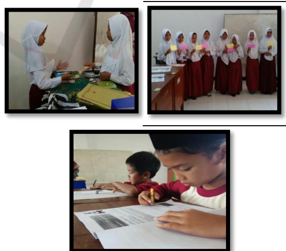
Figure 6: Students are doing the assignment given by the teacher.