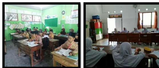
Figure 2: Praying together.