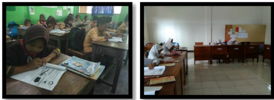
Figure 3: Do the assignment in the test book.