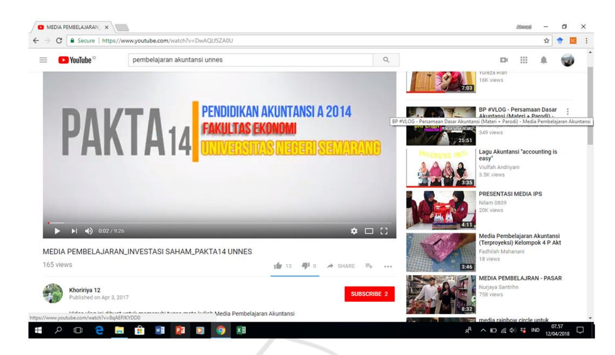
Figure 1: Utilization of YouTube for publication of student work.