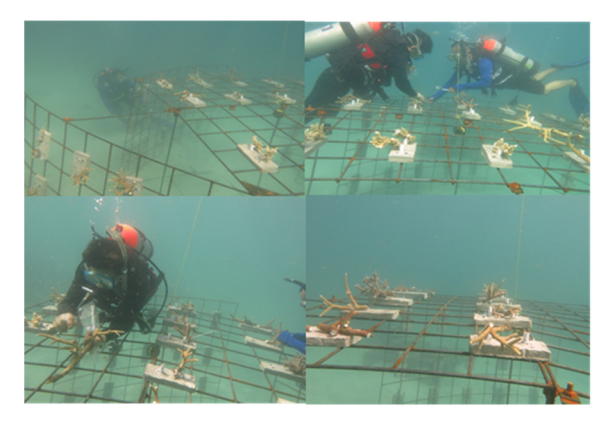
Figure 5: Transplantation process.

underwater by the divers. After main structure assembled complete, specimen of coral transplantation can be plant in the CACO3 medium. Each specimens planted have 10 cm length.