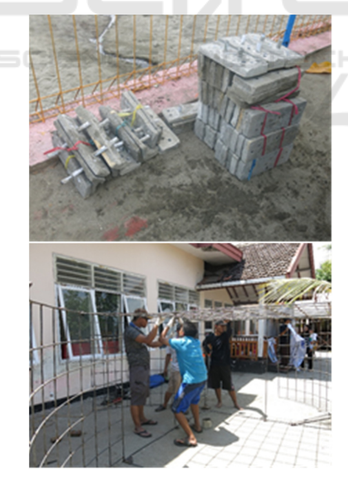
Figure 4: Medium and main structure.

Main structure then dismantle and loaded onboard in pieces. This pieces will be assembled together