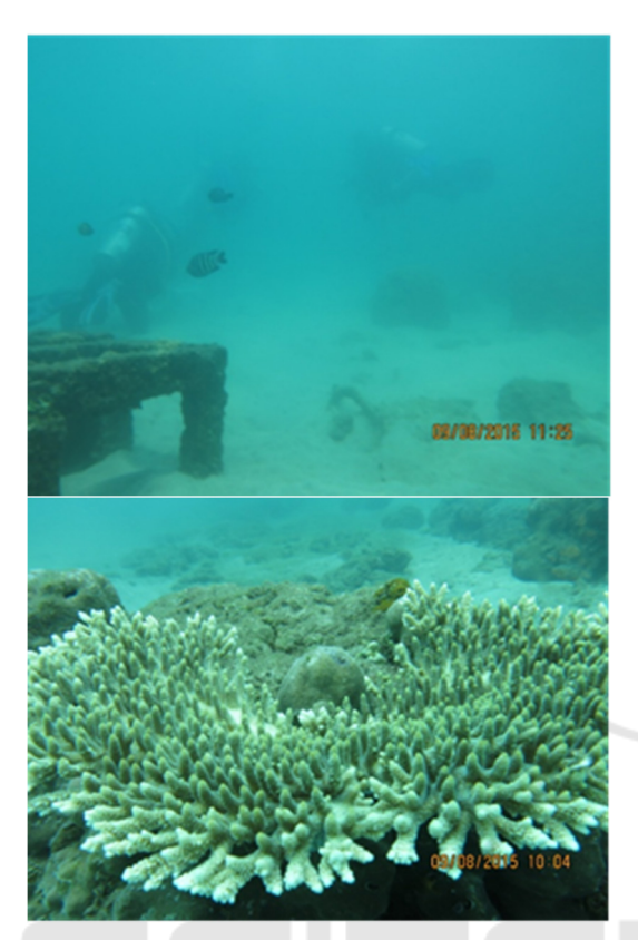
Figure 3: Habitat for Coral Reef.