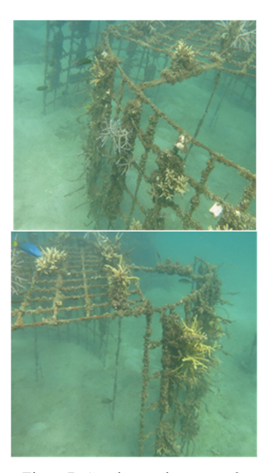
Figure7: Coral growth process 2.