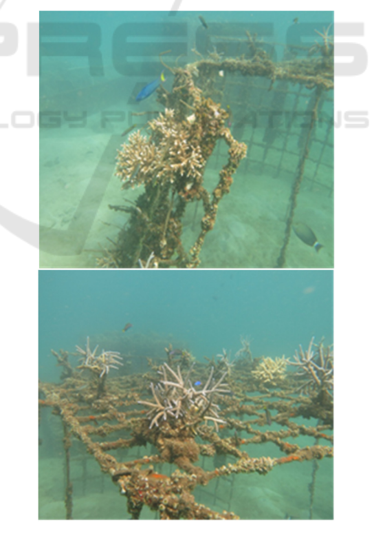
Figure 6: Coral growth process 1.

Result of the transplantation reported as consideration for any stake holder to continue this research to save coral reefs and create better sea environment.