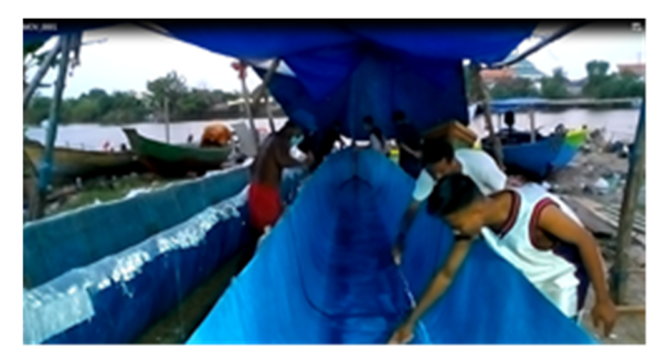
Figure 5: Gel Coating Process.

The mold surface is waxed as much as 5-7 times for new molds. The last process in making the mold is the provision of PVA (Polyvinyl Acrylate) membrane, this is so that the boat does not stick to the mold. The process of FRP boat lamination begins with the provision of Gelcoat layer (the outer layer as a protective hull) on the mold, this layer is given 2 times so that the resulting FRP catamaran boat is thicker in color.