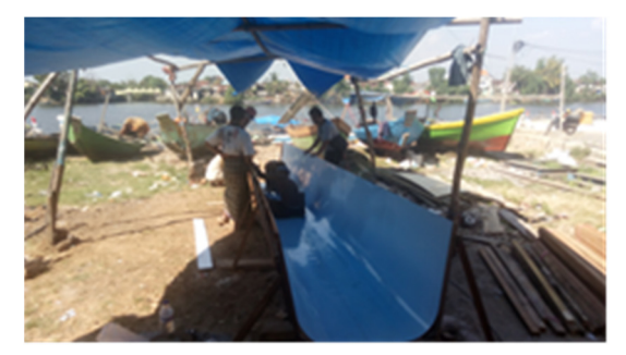
Figure 4: Mold making Process and mold result.

caulked to flatten the surface of the mold in order to smooth the hull.