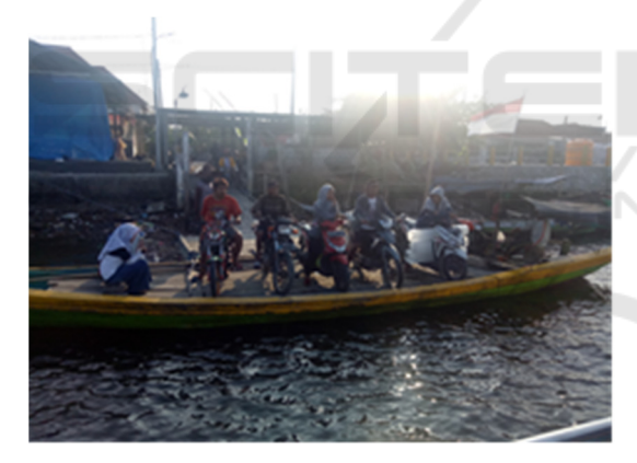
Figure 1: Condition of Existing Wooden boat.

A survey of existing vessels is carried out to determine the current condition of the ship. The survey method is to measure the dimensions of the ship so that the length, width and loaded of the ship are obtained. Another objective of surveying the condition of the boat is to know the aspect of safety, stability of the boat