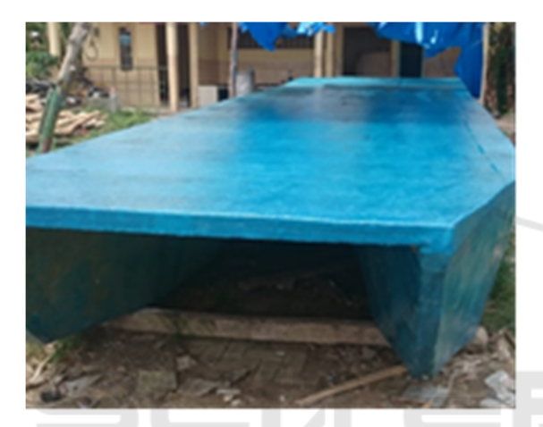
Figure 8: Catamaran Boat has been finished.