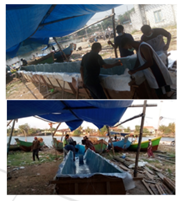
Figure 6: FRP Lamination Process.

MAT 300), then we give WR 800 layer, the next layer uses MAT 450 and so on to the last layer according to the lamination schedule.