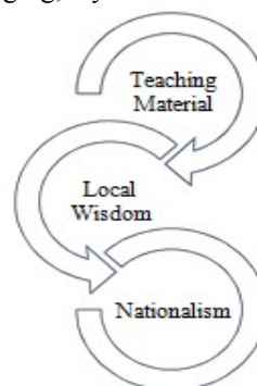
Figure 1. Conceptual Framework

Integrating the values of nationalism in learning process are listed in the curriculum of 2013, which focuses on develop student character building. Kemendiknas formulates 18 characters what will be implemented in the learners as an effort to build the character of the nation. These characters are: 1) religious, 2) honest, 3) tolerance, 4) discipline, 5) hard work, 6) creative, 7) independent, 8) democratic, 9)curious, 10) the spirits of nationalism, 11) the love to the homeland, 12) appreciate achievement, 13) communicative, 14) peace-loving, 15) like to read, 16) care about the environment, 17) social concerns, and 18) responsibility. Meanwhile general guidance of character education from national education of Indonesia mention that nationalism consist of patriotic, willing to sacrifice, equitable, dedication, sense of belonging, loyal to the country.