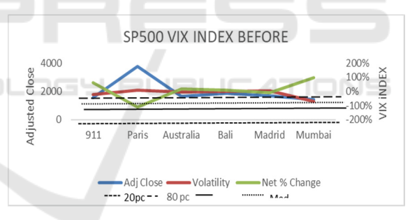
Figure 4: Before VIX SP500 Index with adjusted close and Net % Change.

Historical prices for the war stocks and the S+P500 adjusted for splits and dividends were collected from Yahoo! Finance. To understand if the terror attacks were associated in periods of high volatility and abnormal returns, we measured the market variance using the VIX index calculated with a 50-day moving average. This is a market indicator for the measurement of uncertainly.