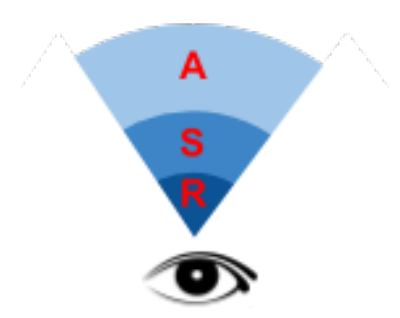
Figure 2: Zones of visibility in the field of agent's vision. Zone marked ' R ' is Reach , ' S ' is See and ' A ' is Appear .