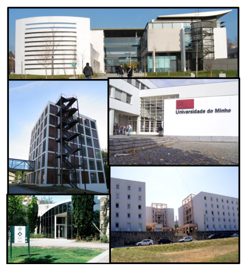
Figure 3: Map used in TechPaper.