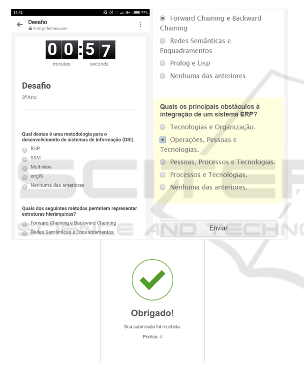
Figure 4: Forms example.

The challenges goals were to promote teamwork, challenge the knowledge students acquired over the years in MIEGSI, and to promote the interaction between students from different school years. About the challenge itself, five forms were spread around the Campus and could only be activated by QR-Code - Figure 4. Each form had three questions related to lectured courses in MIEGSI: one form was related to the first year, another to the second year and so on. Two of the questions were low/medium difficulty and one of them had a high difficulty cap. Each team had 60 seconds to answer the forms, and each one was worth 8 points.