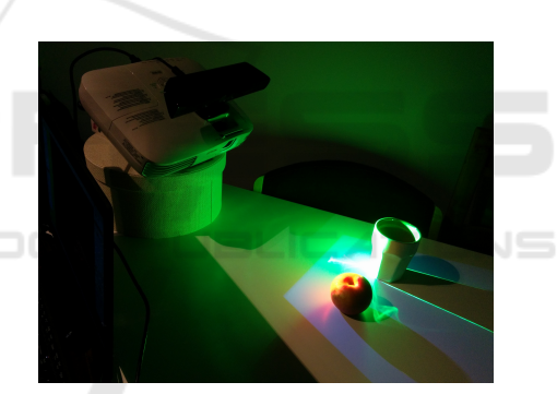
Figure 1: Experimental setup and the example of highlighted object.

The primary use case of our system is selection and manipulation of objects that are placed on a tabletop in front of the user. UI presented in this paper consists of projector, depth camera (such as Microsoft Kinect) and user action input device. Our system can be used with several user action input devices, namely sip/puff, consumer grade brain computer in-