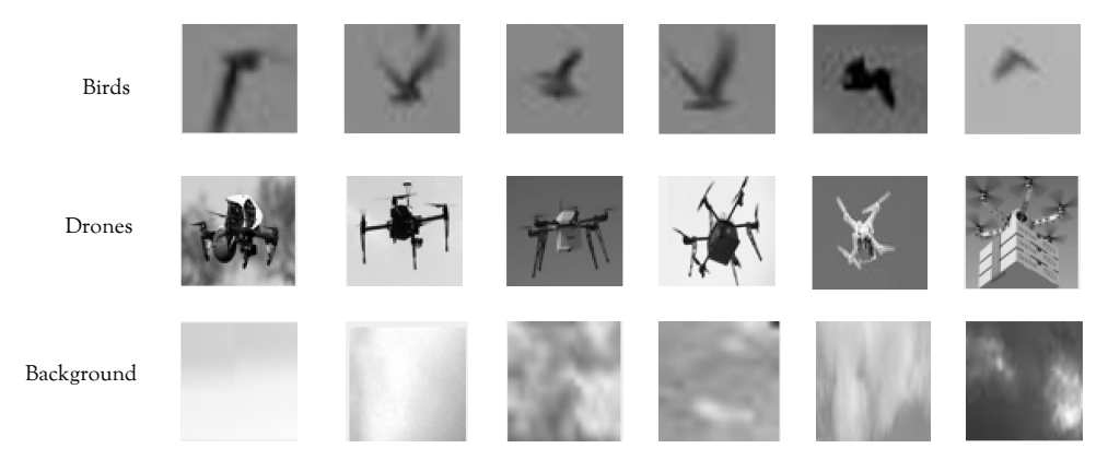
Figure 2: A few examples of the 64x64 grayscale bird, drone and background patches from the images we have collected from the internet.