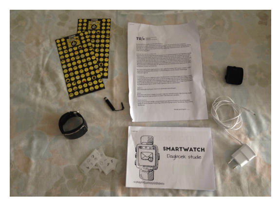
Figure 4: Package for the diary study.

Privacy. Regarding the theme of data privacy, it was found that opinions varied. While 2 participants indicated not having problems sharing data acquired by