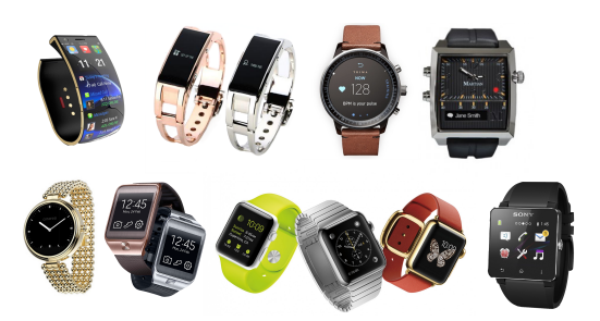
Figure 3: Picture of different smartwatches, shown during the interviews.

The data collected during the interviews were analyzed by means of a thematic analysis (Aronson, 1995).