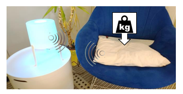
Figure 3: ActiSit prototype (pillow, table lamp).

We developed two functional prototypes for the ActiThings toolkit. A new prototype, called ActiSit , addresses prolonged sedentary behaviour. It collects sensor data on sitting activity to detect possibly opportune moments for physical activity. The relocatable pillow is equipped with a pressure sensor that identifies a sitting person and measures the time of sitting (see Figure 3).