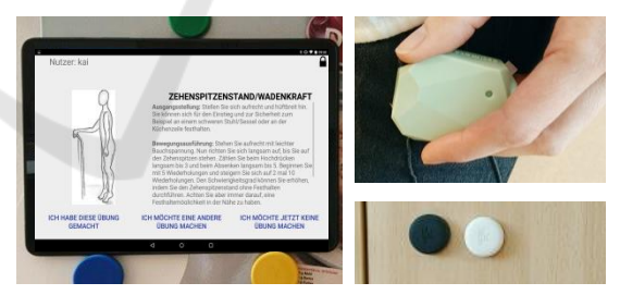
Figure 4: ActiConverge prototype (tablet-based PC with exercise program, Bluetooth beacon, Bluetooth buttons).

The ActiConverge prototype was refined with additional features for documenting the adherence to the physical exercise intervention. The tablet-based PC then presents exercises, gives guidance on how to conduct the exercises, allows writing an exercise diary, and presents badges and achievements. Moreover, we added two Bluetooth buttons for a quick logging of (non-)completion of physical exercises, which can be placed anywhere according to user preferences (see Figure 4).