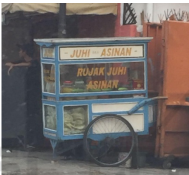
Figure 1. Betawinese pickle traditional carts. (Nediari, 2018).

food carts only operate during the day so they do not need special lighting to support the selling activity. It is founded from the observation of traditional Betawinese food carts that nowadays some of traditional food carts have been modified based on the needs of food vendors. As shown picture, Betawinese pickle traditional carts has been modified by adding bicycle into carts because it is more efficient to paddle than to walk. The cart is made of wooden frame, glass on three sides of the carts and title of the dishes on the front and left side of the cart. This improvisation proved that as long as it does not change the basic function, it is possible to add other features in the carts. The color does not have certain meaning, but certain carts identify type of selling food.