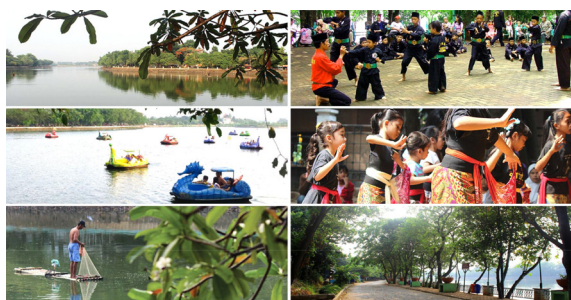
Figure 1: Setu Babakan – cultural activities and ambient.

Betawi specialties of culinary are often found in the Setu Babakan tourism area, such as; Kerak Telor, Toge Goreng, Arum Manis, Rujak Bebeg, Soto Betawi, Es Potong, Es Duren, Bir Pletok, Nasi Uduk, Nasi Ulam , etc. was sold there.