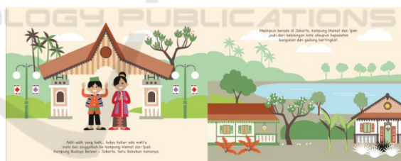
Figure 3: Visual for the script of plot 1.

Di kampung ini masih banyak dijumpai rumah-rumah Betawi yang asri, rindang pepohonan hijau dengan sebuah danau besar menghampar seluas kampung yang dinamai danau Setu Babakan. Di kampung inilah Mamat dan Ipeh tinggal, bermain dan belajar bersama teman-temannya.