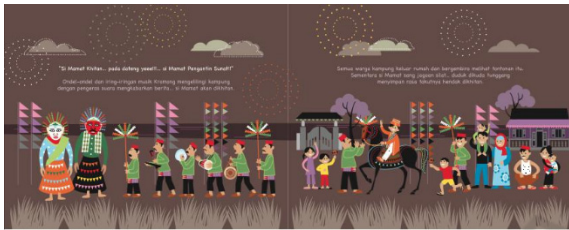
Figure 4: Visual for the script of plot 2.

sambil menyimpan rasa takutnya hendak di kithan.