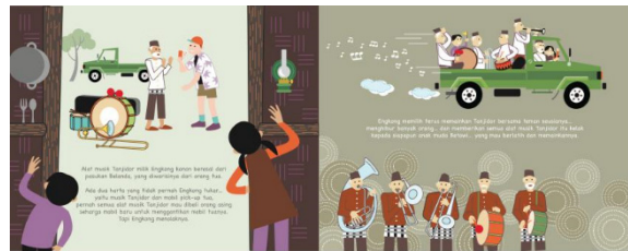
Figure 5: Visual for the script of plot 3.

Alat musik Tanjidor milik Engkong konon berasal dari pasukan Belanda, yang diwarisinya dari orang tua