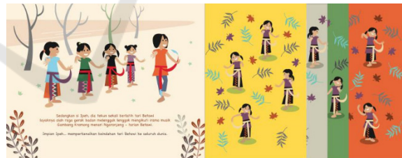
Figure 6: Visual for the script of plot 4.

Sedangkan si Ipeh, dia tekun sekali berlatih tari Betawi, layaknya olah raga gerak badan melenggak-lenggok mengikuti irama musik Gambang Kromong menari ‘Ngaronjeng’ – tarian Betawi. Impian Ipeh... memperkenalkan keindahan tari Betawi ke seluruh dunia.