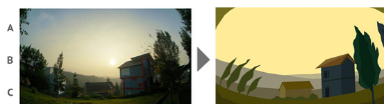
(a) Photography (b) illustration